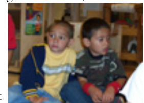
Eager to learn!