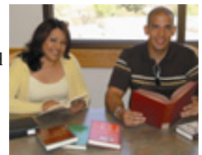
Students in Mexico