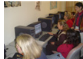
SOE faculty learning