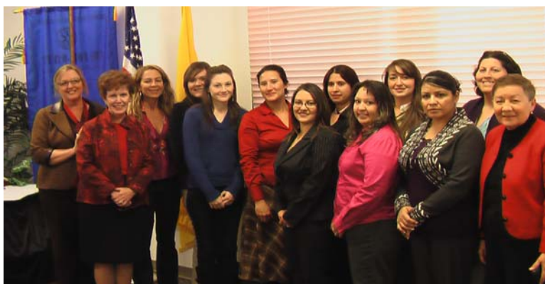
Pictured here are some of the Fall 2010 Scholarship recipients along with some of our SOE Faculty.