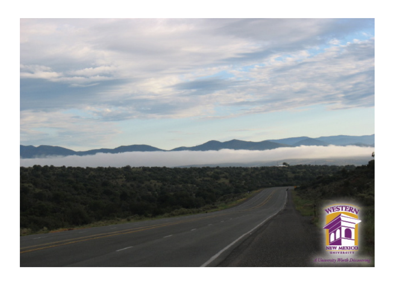
2008 Fall Commencement Convocation